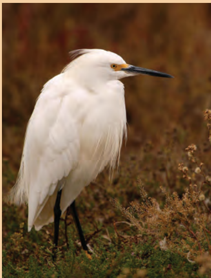
SNOWY EGRET.

The people who raise the most funds during the Fall Challenge win fantastic prizes! Last year's grand prize was a seven-day birding trip to Arizona.