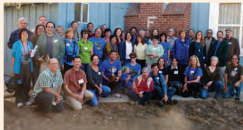
Attendees at the 2012 Annual Meeting.