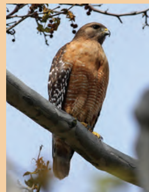
RED-SHOULDERED HAWK.

Matching Gifts are a great, easy way to double or even triple your donation to SFBBO. Many companies support employee philanthropy by offering matching gift programs. Please check with your HR department to see if your employer will match your gift to SFBBO. Employer contributions are counted towards your CFC Fundraising Competition total. If your company would like to learn more about our work, one of SFBBO's scientists can make a Lunch 'N Learn presentation to your staff. Your staff can also come to our Coyote Creek Field Station for team-building activities centered around our bird banding program or restoration activities.