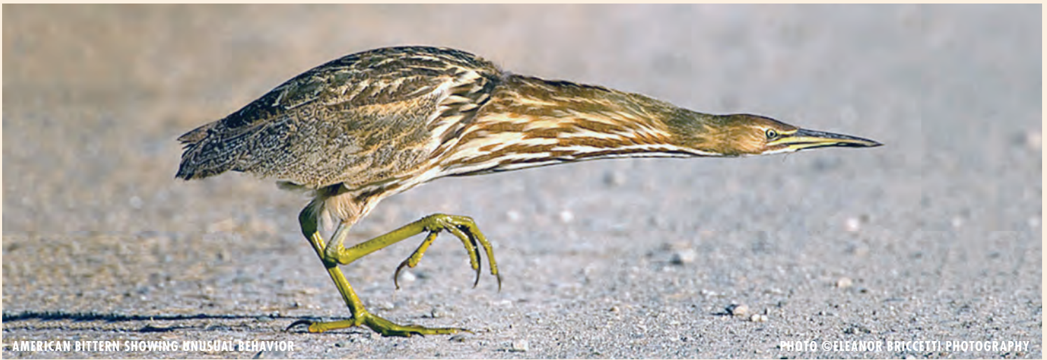
AMERICAN BITTERN SHOWING UNUSUAL BEHAVIOR