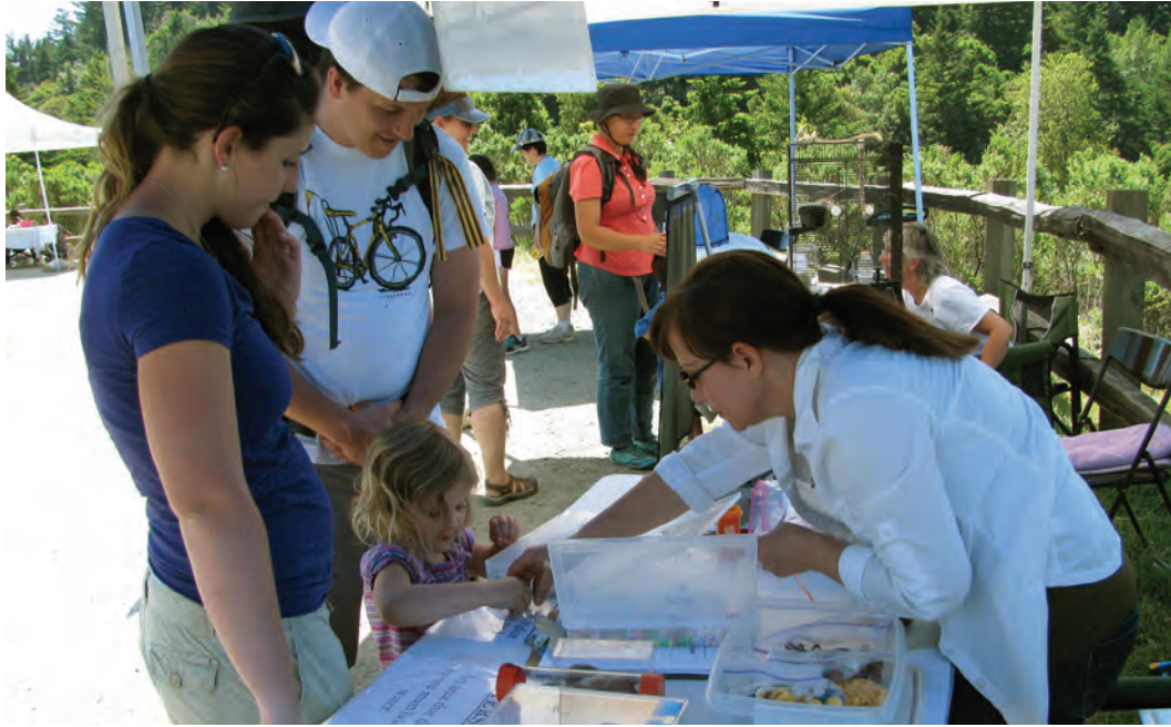
FAMILIES LEARN ABOUT AVIAN SCIENCE AT WING DING FAMILY FEST IN MAY.