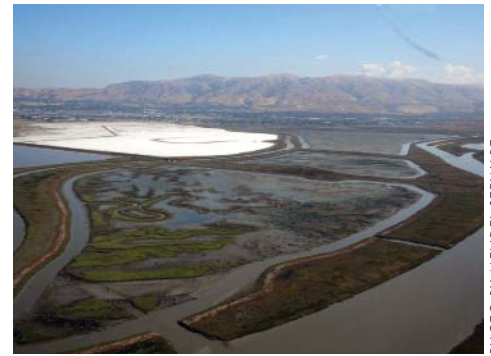
A SALT POND landscape in Alviso.

Mercury Study (USGS, UC Davis): Researchers are studying mercury methylation and bioaccumulation at this pond, as well as in Alviso Slough area. They are monitoring nests of two species, Forster's Tern and American Avocet, and collecting eggs for mercury analysis. Forage fish that these bird species eat, as well as sediment and water samples, are also being collected and analyzed for mercury. All of these data should reveal if legacy mercury from the upstream New Almaden Quicksilver mine, which has deposited in Pond A8 and surrounding areas, is being made more available in the food chain, resulting in mercury bioaccumulation in bird eggs and negative impacts on Bay water quality.