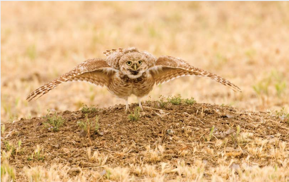
BURROWING OWL DISPLAYING, Endangered Species Category Winner by Eleanor Briccetti.