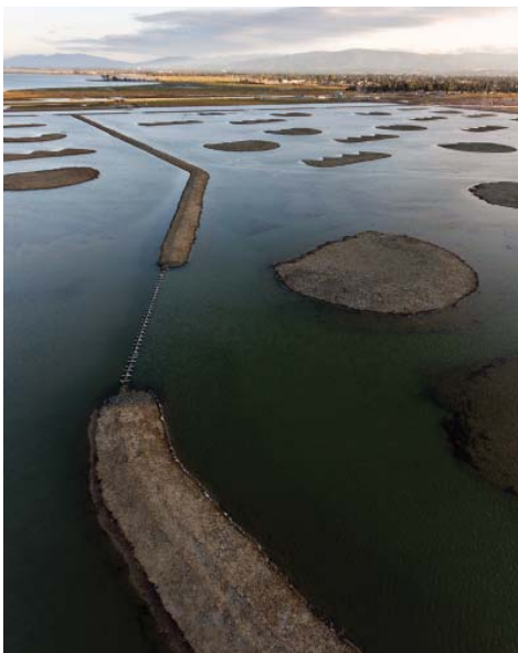
POND SF 2 (see field trip to SF 2 on page 6).

Want to know more about the South Bay Salt Pond Restoration Project? Visit their website at www.southbayrestoration.org or follow them on Facebook.