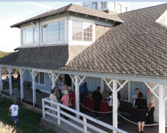
OUR 30TH ANNUAL Membership Meeting at the South Bay Yacht Club in Alviso.