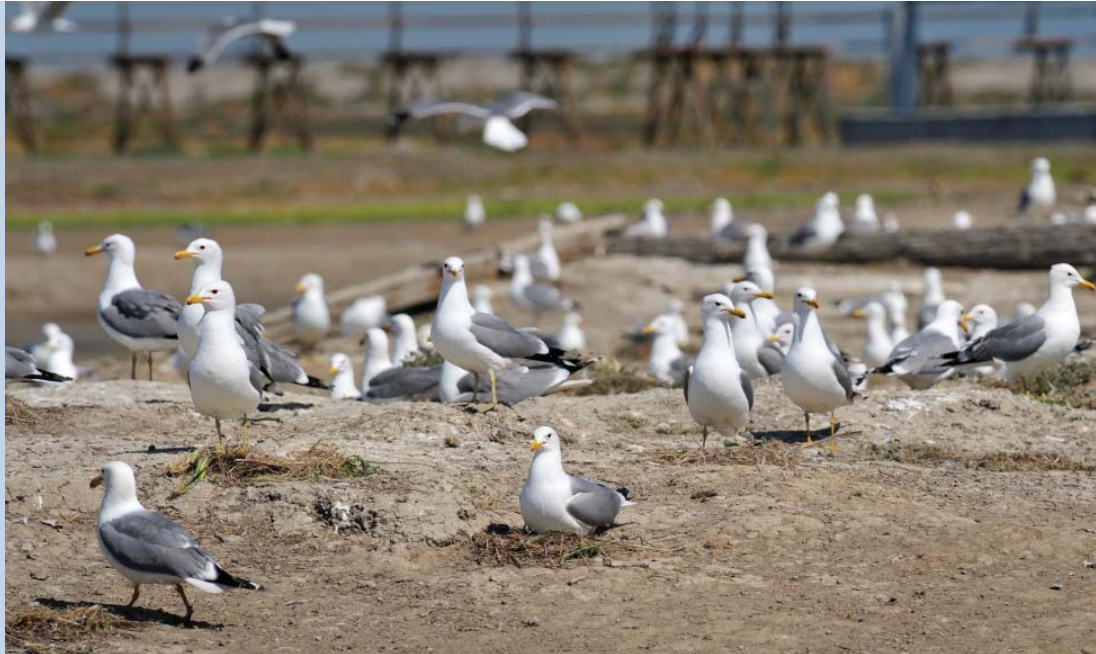
CALIFORNIA GULLS formerly nesting on Pond A6.