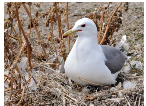
CALIFORNIA GULL nesting on former Pond A6.

Although the California Gull population in the South Bay decreased in 2011, gulls continue to be a management concern in the San Francisco Bay. We were successful in deterring gulls from nesting in one sensitive area in 2011; however, they may attempt to nest again in the future at other sensitive areas. In coming years, SFBBO will continue to monitor the California Gulls to track the population and identify potential conflicts with other breeding waterbirds.