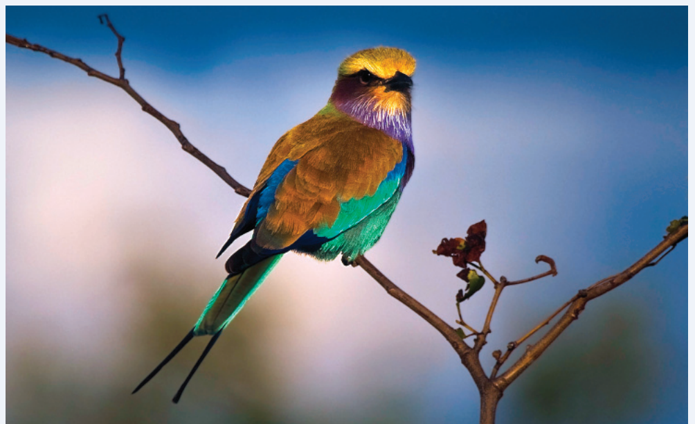
LILAC-BREADED ROLLER, Birds of the World Category Winner