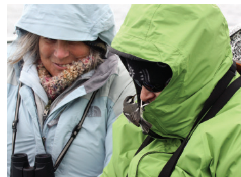
BIRD WATCHING CLOSE UP, Human Interaction Category Winner