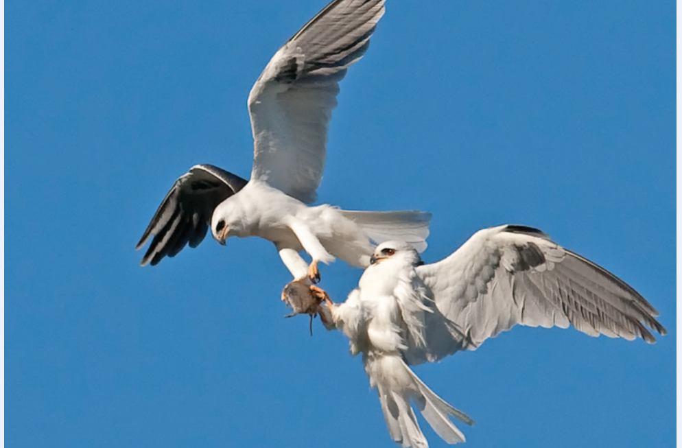
WHITE-TAILED KITE HANDOFF, Bird Behavior Category Winner and Best in Show