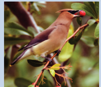
CEDAR WAXWING