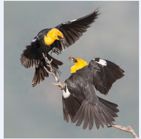
"FOOD FIGHT," by Beth Hamel, winner of the Bird Behavior Category.