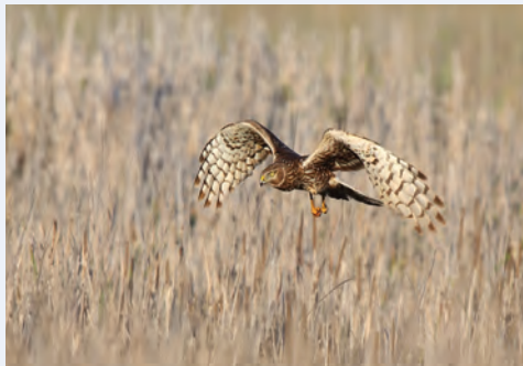
"NORTHERN HARRIER, Hunting for Dinner," winner of the Birds and Their Habitats Category