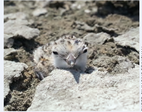
Newly-hatched Western Snowy Plover chick.

Low numbers of banded birds and challenging re-sighting conditions make meaningful estimates of fledging success and dispersal difficult, and we are working with other plover researchers to explore improved observational methods