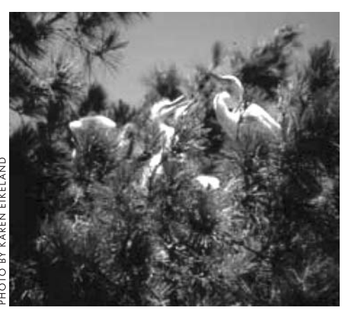
A FAMILY of Egrets at Harbor Bay.

The Harbor Bay project is a part of Bay Farm Island, a portion of Alameda, and its lagoons have been in existence about 30 years. Historically Bay Farm Island was the location of extensive marshes between what later became Oakland Airport and Alameda, and an important stopover for birds migrating along the Pacific Flyway. Most of that ended beginning in the 1950's with the draining and filling of the marsh, the coming of a large sanitary landfill, the construction of two golf courses, and extensive commercial and residential development. The lagoons were built as amenities for homeowners alongside them, and not for wildlife enhancement.