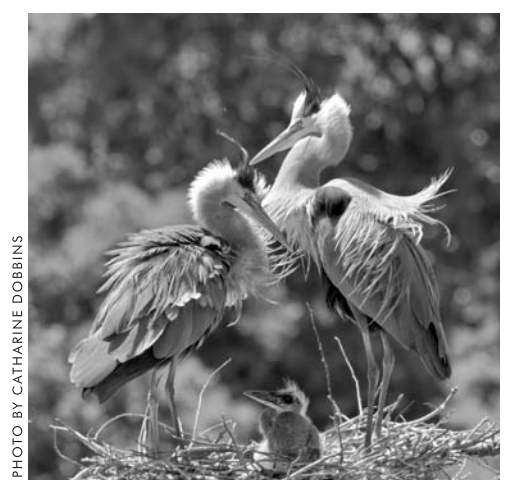
GREAT BLUE HERONS at the Hillsborough Crocker Lake Open Space Preserve.