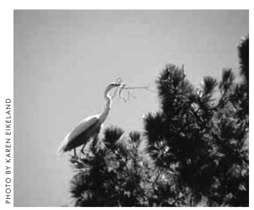
A GREAT EGRET carries nesting material.

13 nests at a second grove a short stroll down the lagoon path. Productivity was extremely high, and we estimated more than 100 birds fledged from the two sites.