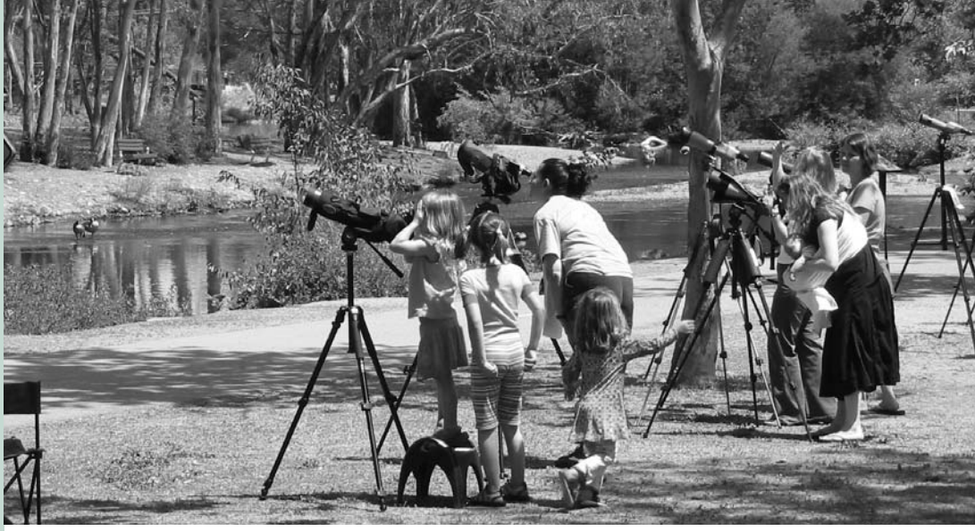
VISITORS SPY on Great Blue Heron chicks in their nests.