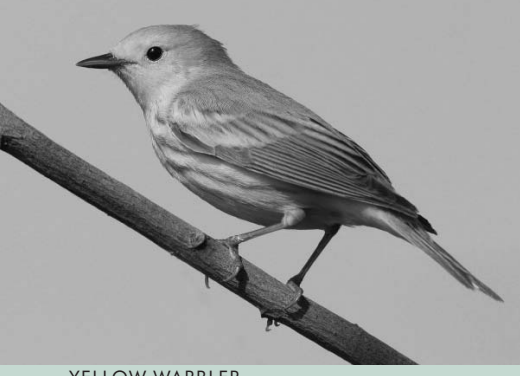
YELLOW WARBLER