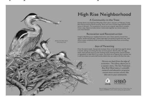
A PERMANENT SIGN marks the presence of the Vasona Great Blue Heron colony.