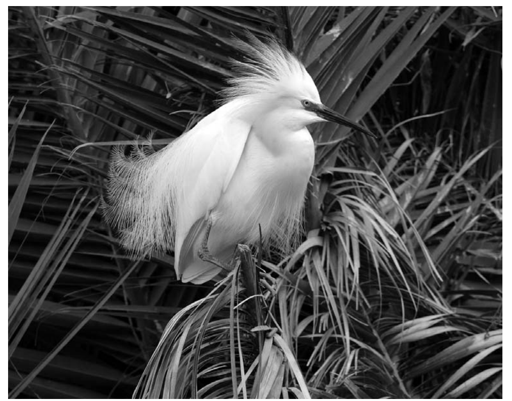
A breeding Snowy Egret shows off its spectacular plumage