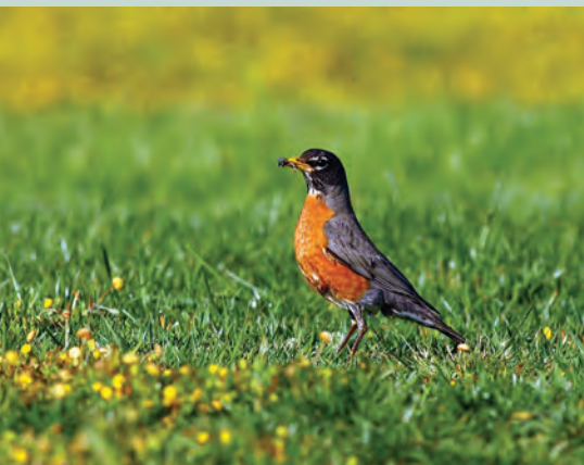
THE AMERICAN ROBIN is a welcome sign of spring.