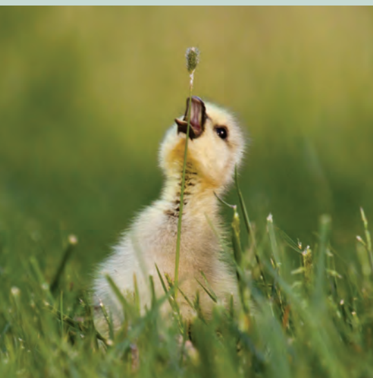
CANADA GOOSE GOSLING.