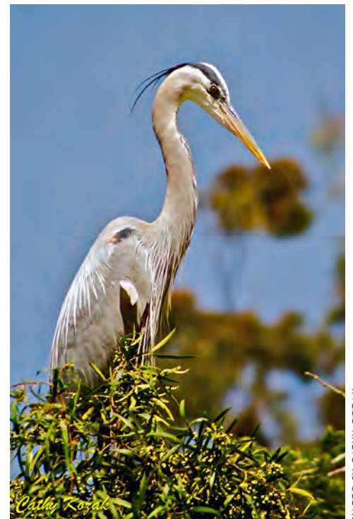
GREAT BLUE HERON at a nesting colony.