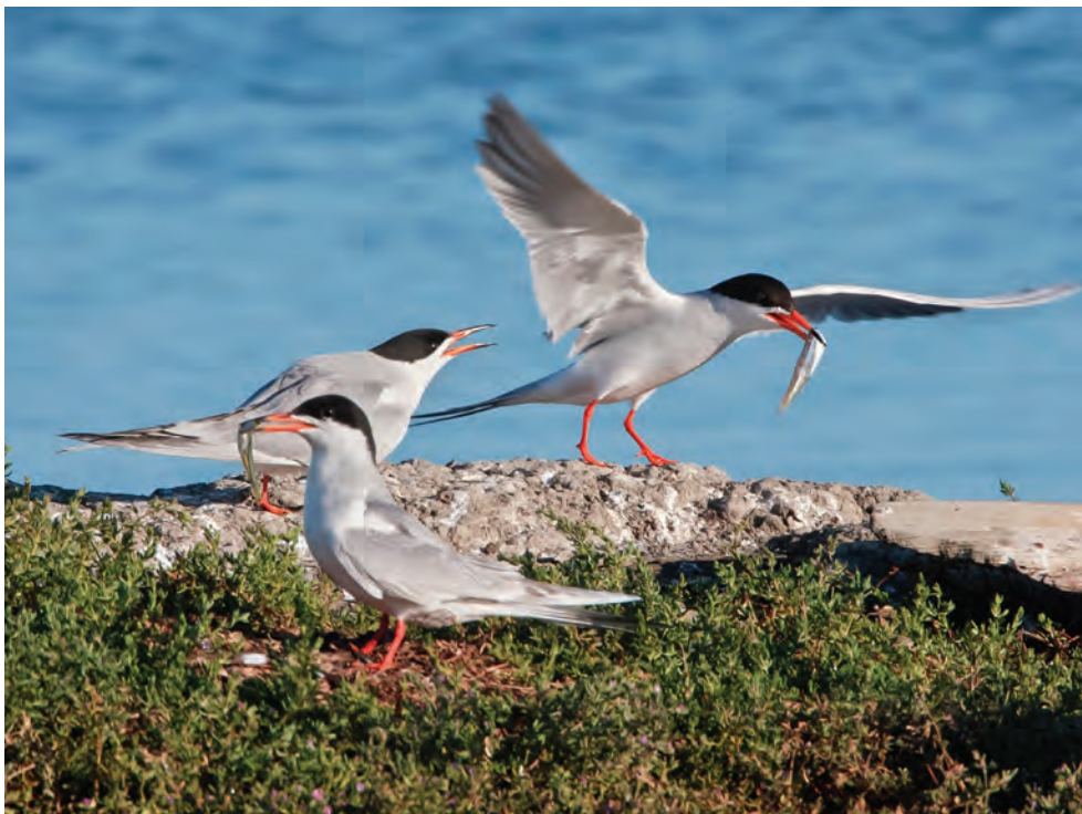
FORSTER'S TERNS engage in spring courtship.