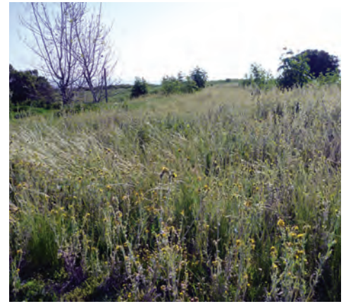
COMMON FIDDLENECK ( Amsinckia menziesii ) growing along the EEC entrance road in 2011, the second year after seeding.

This year we are seeding 28 species at three sites in the South Bay: Faber-Laumeister Tracts, Pond A6, and LaRiviere Marsh. These sites are tests of the methods and materials we have developed from our work at the EEC, and we look forward to monitoring their results in 2012. Additionally, we continue to test and refine our methods as well as