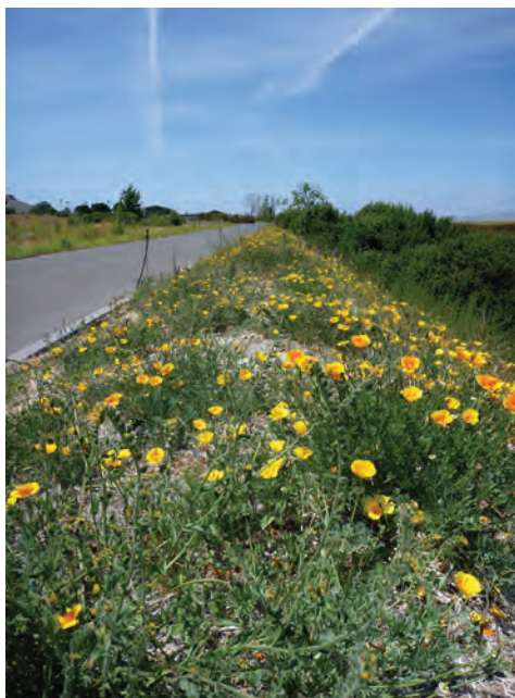
CALIFORNIA POPPIES ( Eschscholzia californica ) grow on a berm at the EEC in 2010, their first year after seeding.