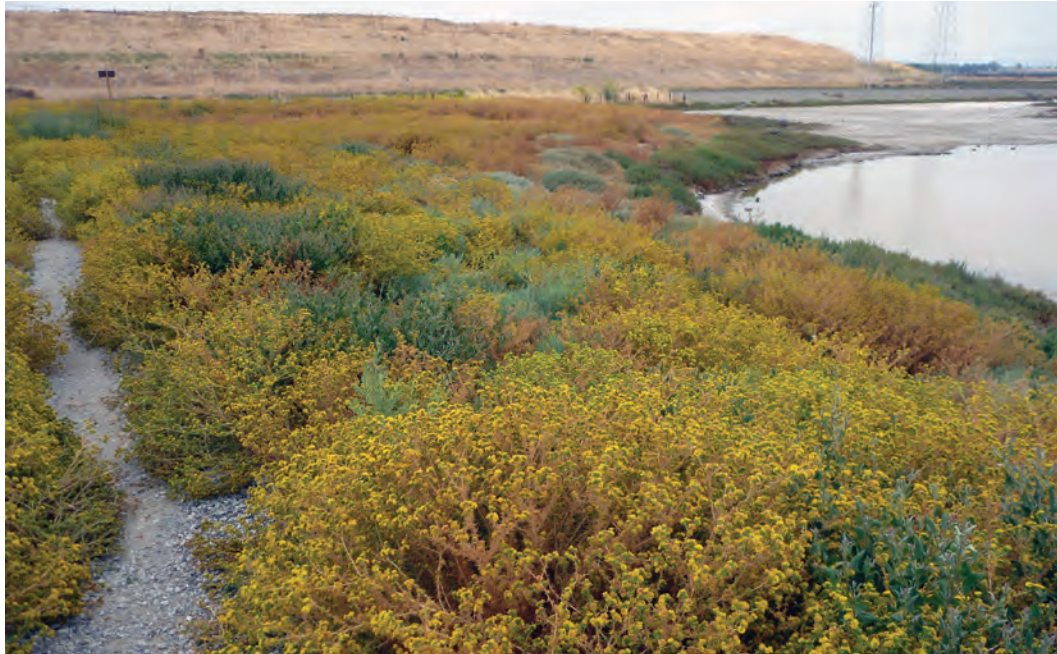
COMMON SPIKEWEED blooms in flats near the EEC parking lot.