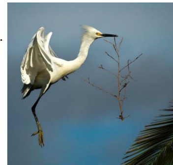
A Snowy Egret mid flight with a twig in its bill

"Green Heron Collecting Twigs for Nest" by Hal Trachtenberg is licensed under CC by 2.0