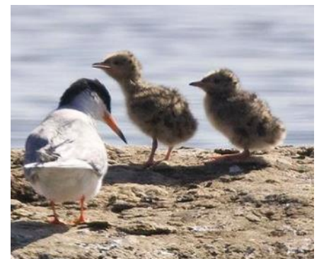
An adult Forster's Tern with its chicks