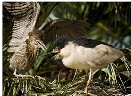
An Adult Black-Crowned Night Heron (Right) accompanying a juvenile (Left)