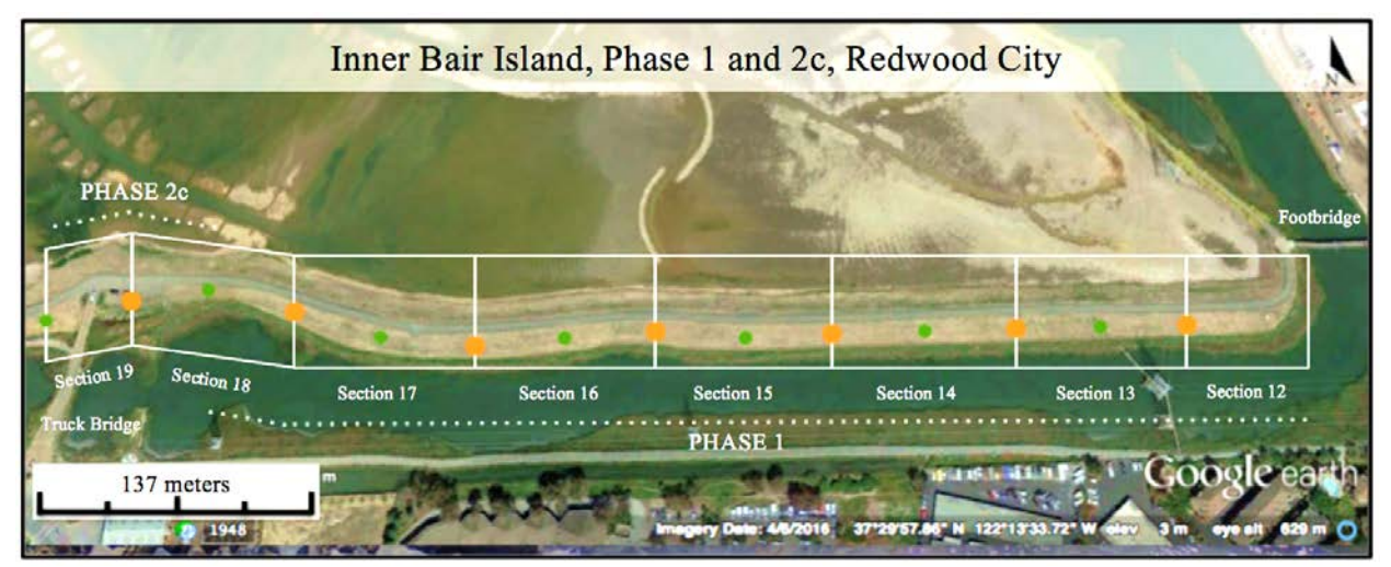
Figure 1. Treatment sections and transect locations.

Site must be described so that observations can be considered in the context of site history, landscape setting, topography, soils, hydrology, and propagule pressures (particularly all active vegetation management). Site description shall also include a layout map showing relevant information for implementing the protocol. Example: